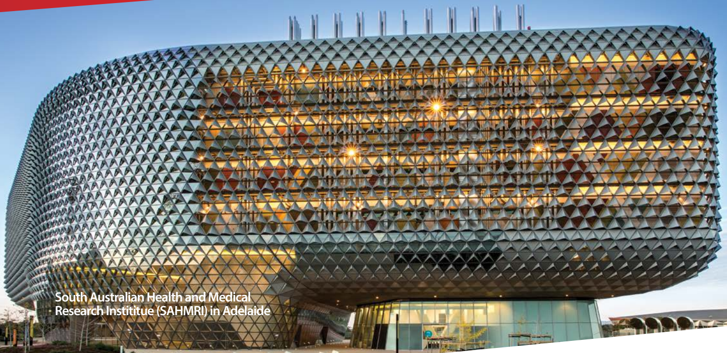
South Australian Health and Medical Research Institute (SAHMRI) in Adelaide

The South Australian Government is offering European companies a unique opportunity to learn about Australia and Adelaide's fast-growing life sciences ecosystem.